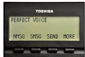
5000 Series Strata CTX (Small Display)

If the digital phone receives a message while it is idle, the Msg LED is activated and the LCD shows the number of new and saved messages that are currently in the mailbox. If messages are marked urgent, then the LCD will show the numbers of new and urgent messages.